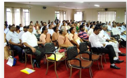
A section of participants

Poddar stressed on issue of sustainability and usage of STG at health centre.