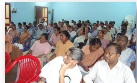
A section of participants

Souza S.J., Archdiocese of Patna appreciate the effort of CDMU and SIGN and stressed on distance course on rational use of medicines