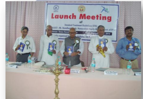
Dignitaries holding the book after launch