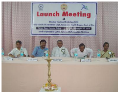
Dignitaries in Launch meeting